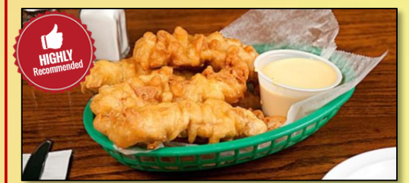
BBQ Style 9.95 Served with ranch dressing Buffalo Style 9.95 Served with blue cheese dressing & celery

Served with our Top Secret Finger Mustard sauce