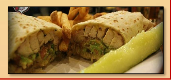
Check Out Our Website Villagetavernandgrill.com See our Daily Specials, Soups and Events

Named after Jose's long lost love. A giant flour tortilla Stuffed with grilled chicken breast, cheddar cheese, pico de gallo, Spanish rice, guacamole and Chipotle Ranch